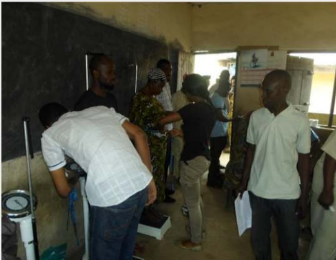
Doctors taking blood for lipid profile