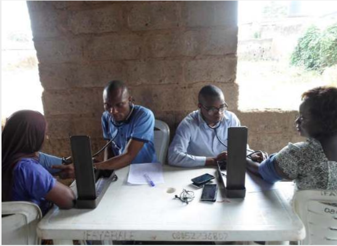
Blood pressure monitoring