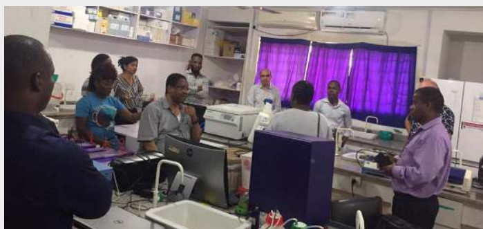
Africa CDC team at Molecular Microbiology Laboratory, Faculty of Pharmacy