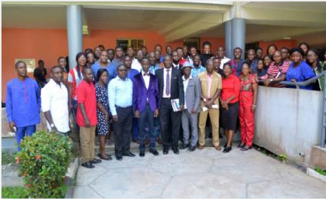
A Cross-section of participants at the 2-day workshop

Other facilitators also exposed the participants to techniques of searching databases, ethics of research, new methods of research, data analysis and research reporting, conducting literature review, writing abstracts, using the UI Manual of Style, as well as maintaining academic integrity.