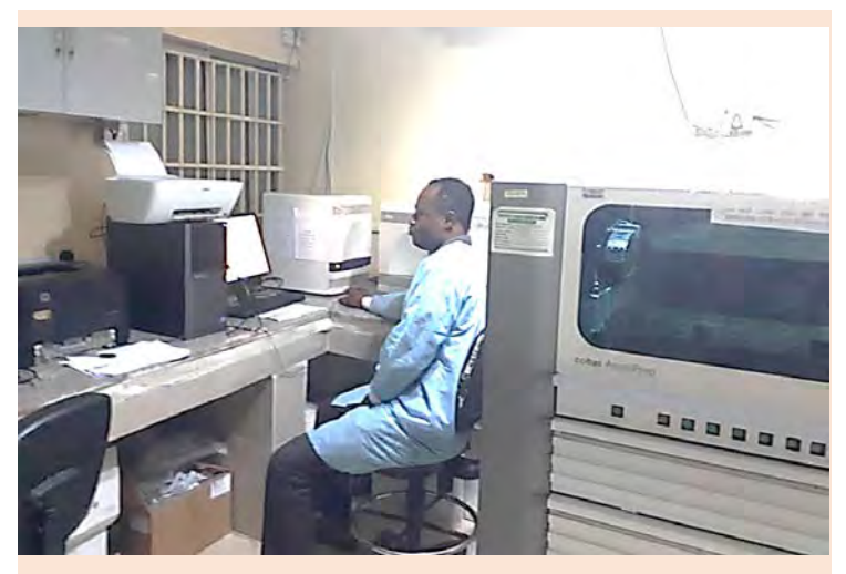
NCDC to the laboratory which is one of the first laboratories in the NCDC Lab Network.

The laboratory has also been enjoying tremendous support of Oyo state government. Certification of the Department for diagnosis of COVID-19 will provide additional research opportunities on COVID-19 at the University of Ibadan and international collaboration on this important disease.